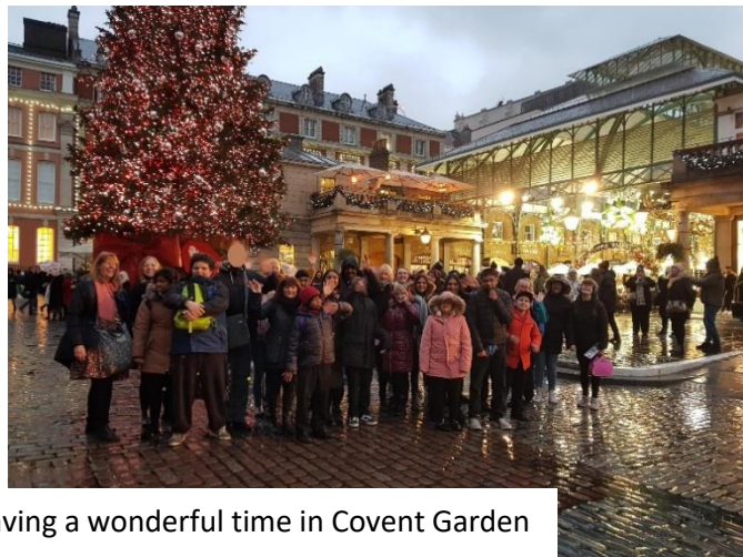
Pupils and staff having a wonderful time in Covent Garden