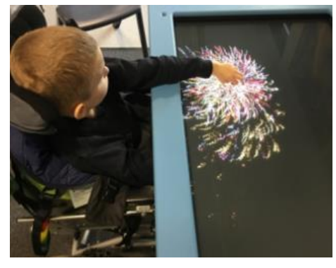
Creating patterns on the touch screen