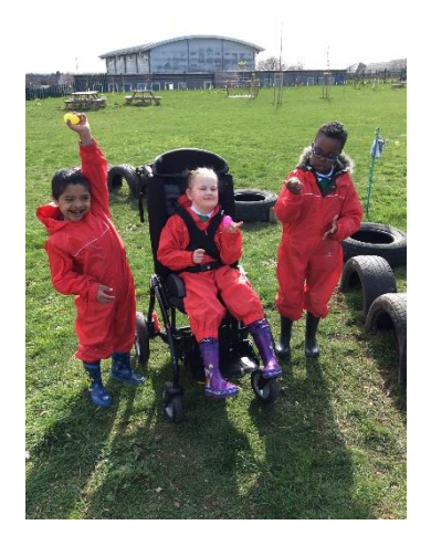
Easter egg hunting