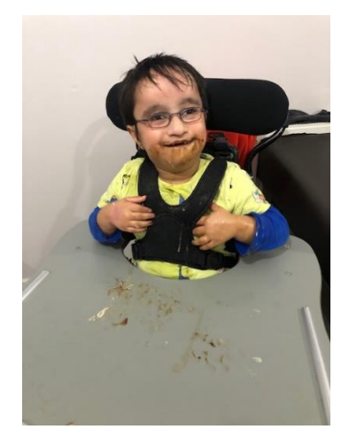
Enjoying making and eating chocolate ganache