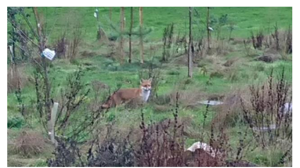
We have a fox that visits us now

The daffodils are out, the blossom is on its way and our amazing willow domes are coming into leaf. The whole area is looking more and more beautiful by the day, even on grey days. It's also great to see that we are attracting wildlife, because, as well as providing a fabulous resource for our students, we wanted to create a haven for wildlife.