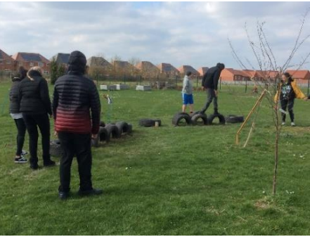
New tyre trail in action

For our Eco School, Green Flag award and in conjunction with Leicester City Council, Sustainable Schools team, we have signed up for the 'Litter Less' campaign. We launched the project on zoom and set the students a half term challenge. We now have our new Super Bin and litter picking equipment and are trying to recycle as much litter as we can.