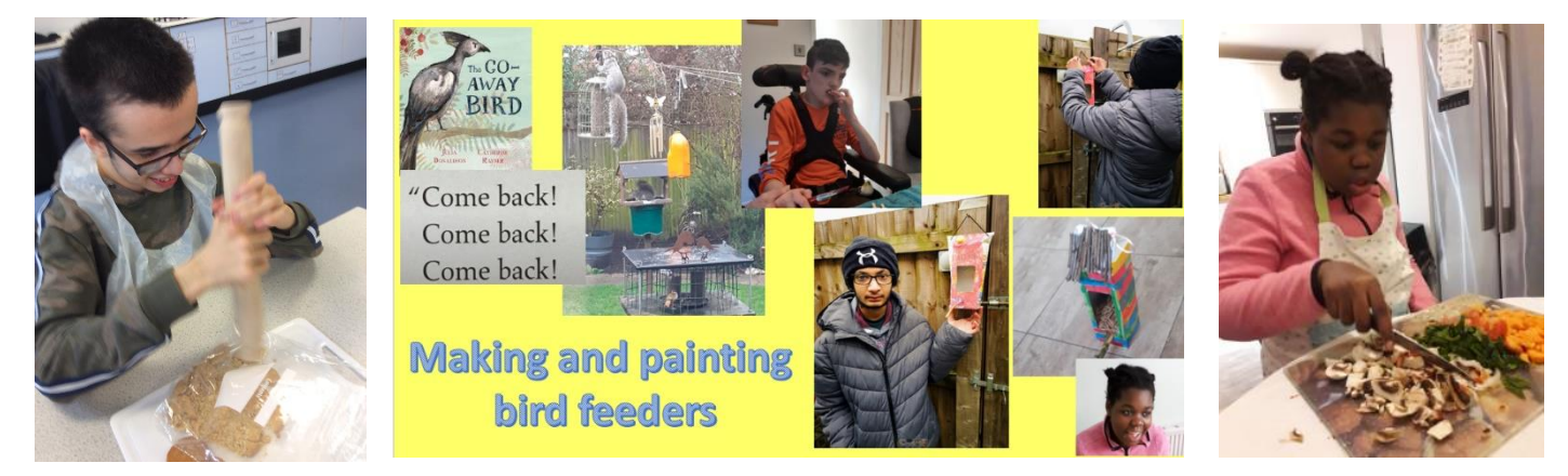
Crushing biscuits to make cheesecake