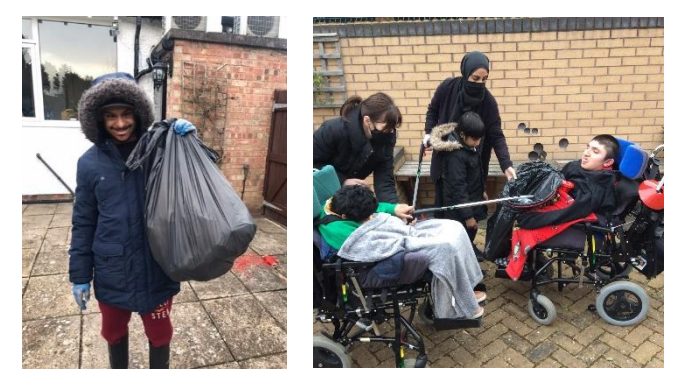
Protecting our environment - litter picking

For our Eco School, Green Flag award and in conjunction with Leicester City Council, Sustainable Schools team, we have signed up for the 'Litter Less' campaign. We launched the project on zoom and set the students a half term challenge. We now have our new Super Bin and litter picking equipment and are trying to recycle as much litter as we can.