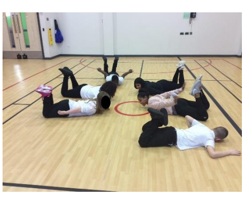
Having fun in PE